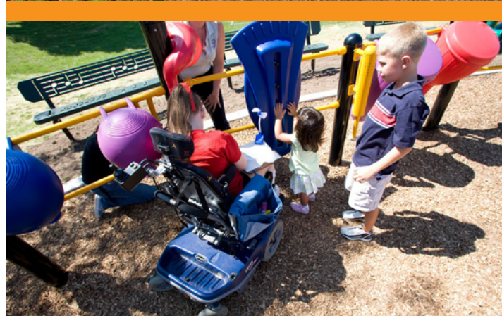
All playground photographs and illustrations courtesy of GameTime and Crozier Enterprises.